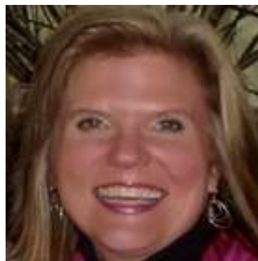
Nina East Affiliate Program